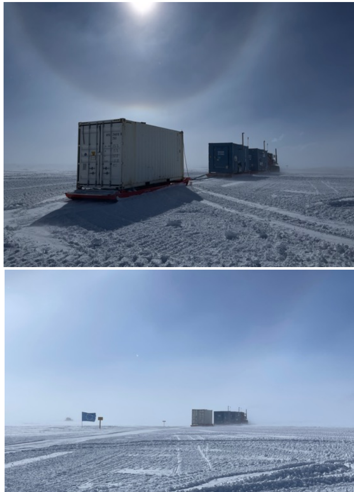
The generators and +4°C container on their way to Concordia.