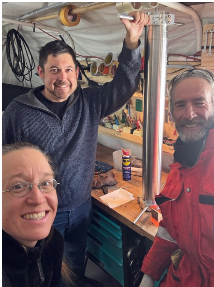
Trying to open the motor section.