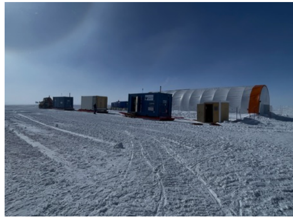
Busy camp.