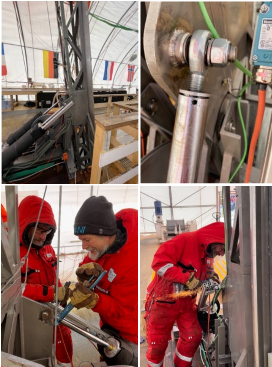
One of the tower pistons needed replacement of the pin.