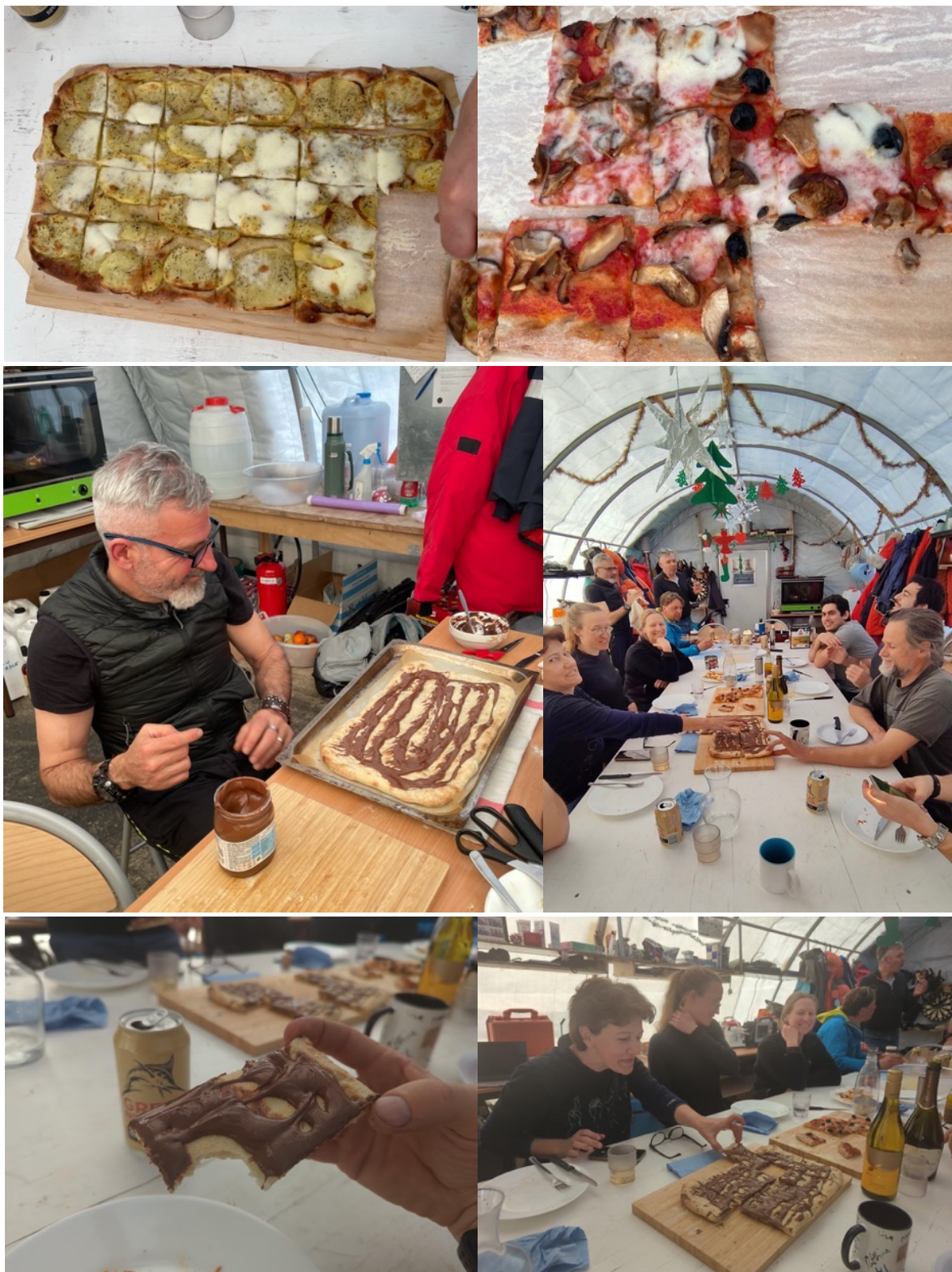
Pizza evening.