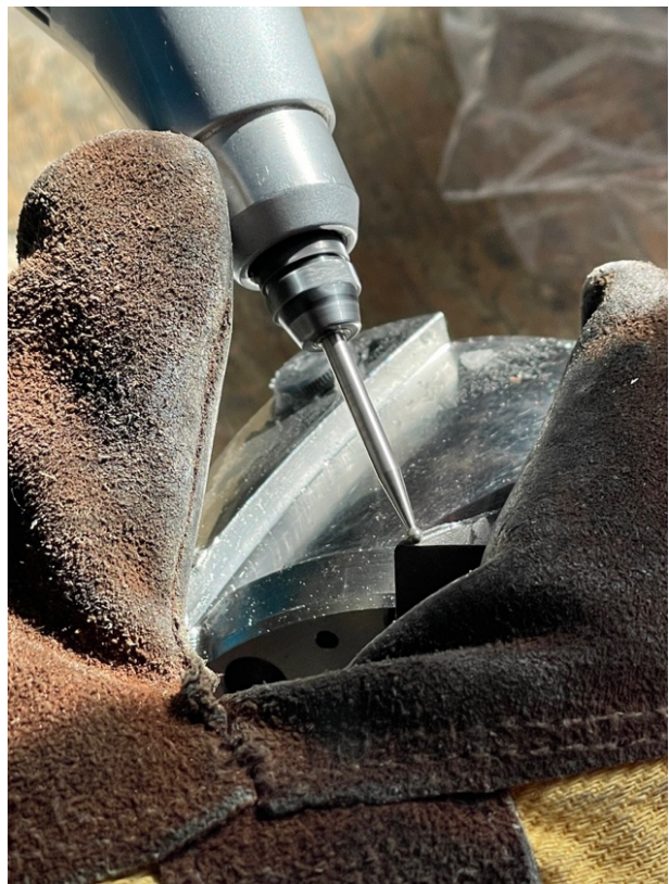
Gunther sharpening the outer edges of the cutters on the drill head.