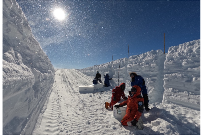
Sampling the 50m trench in 2 teams of 3 people.