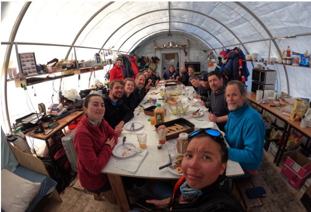
The last dinner at Little Dome C with all the group.