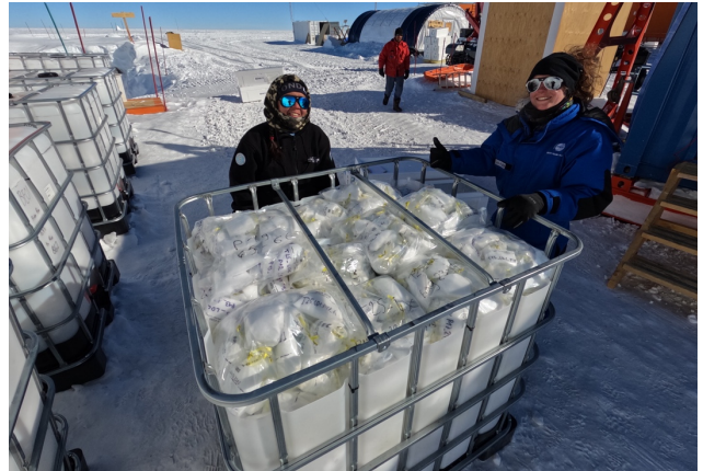
The samples are packed and ready to go.