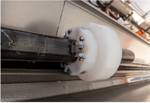
The detached fishing tool, with visible arrangement of the core catchers.