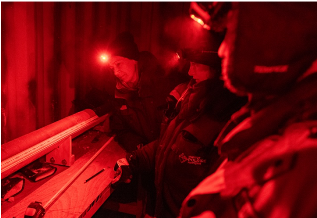
Logging core in the red light to preserve the optical luminescence signal for dating.

Over the last three days we made use of the Arctic truck, that was available for science for the first time at LDC, to do a surface sampling transect from LDC to Concordia station. This project was requested by the isotope consortium and investigates the spatial variation of accumulation from the EPICA core to the Beyond EPICA core.