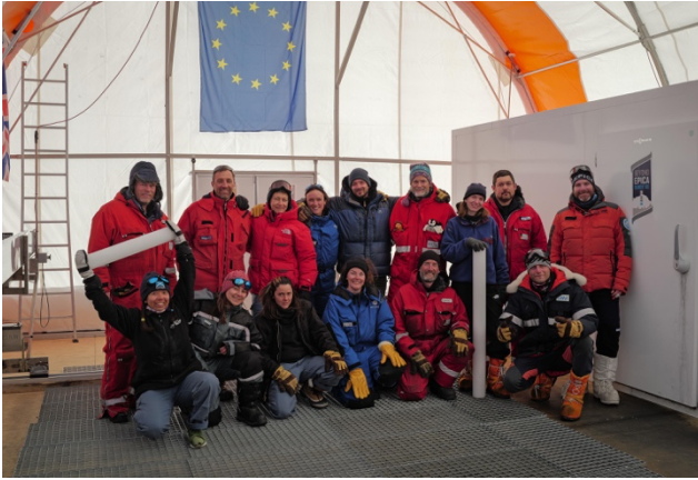
Group picture with ice core published with the official press release. Names and remark see picture before.