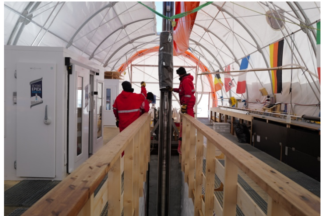
The cover from black rubbish bags and paper rubbish bags to cover the 2 m drill on the tower.