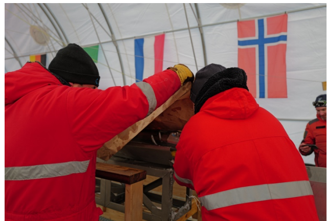
Unlocking the core barrel and putting a light tight plug under a cover.