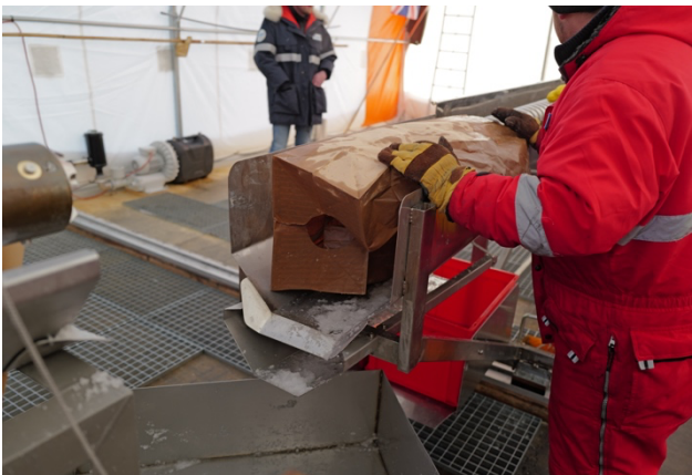
Packing the ends of the core barrel in paper bags.