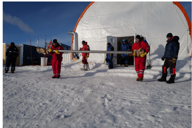
Moving the core barrel to the container in the snow.