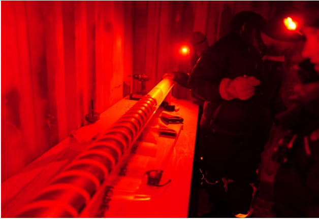
Pushing the core out in red light to preserve the contained minerals for optical dating.