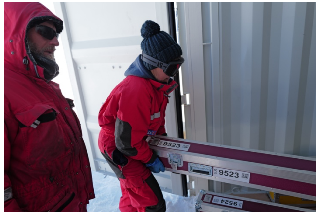
Packing the 4 m drill boxes.