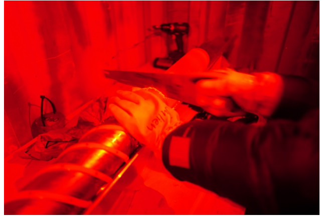
Logging and cutting of the core with a handsaw.