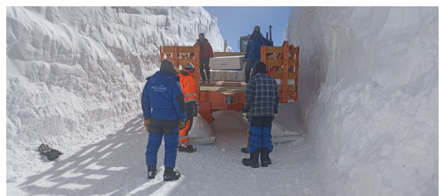
The "sfusi" sled backwards on the ramp of the balloon cave.