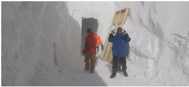
The entrance to the balloon cave.