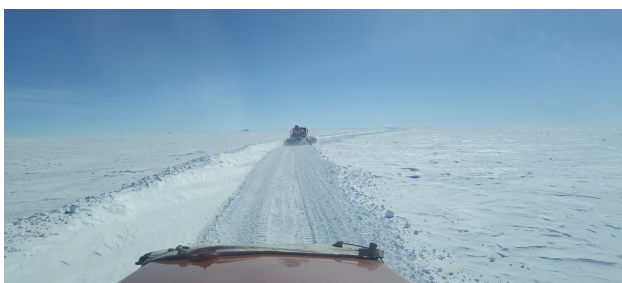
Approaching Concordia station after 38 km over-land travel.