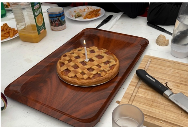
Birthday cake for Saverio.