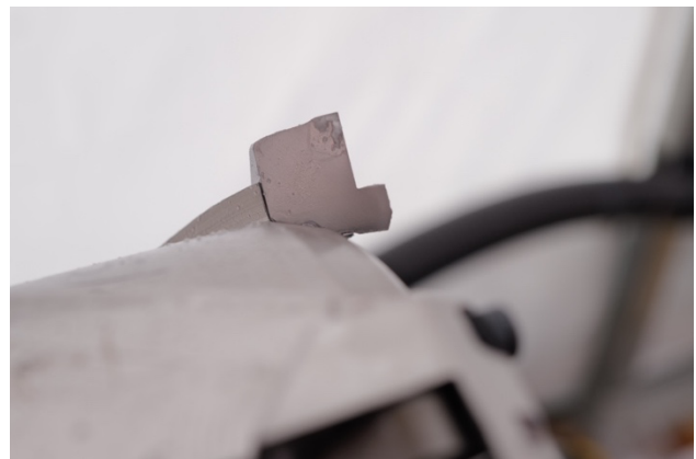
Innermost step cutter with damaged edge.