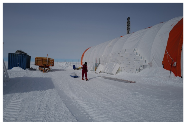
Wall built from core boxes to shade the area of the logging table.