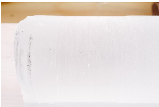
Reduction of diameter by the modified cutters, when running in one spot.