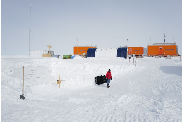
Wall built from boxes to shade the entrance of the processing area.