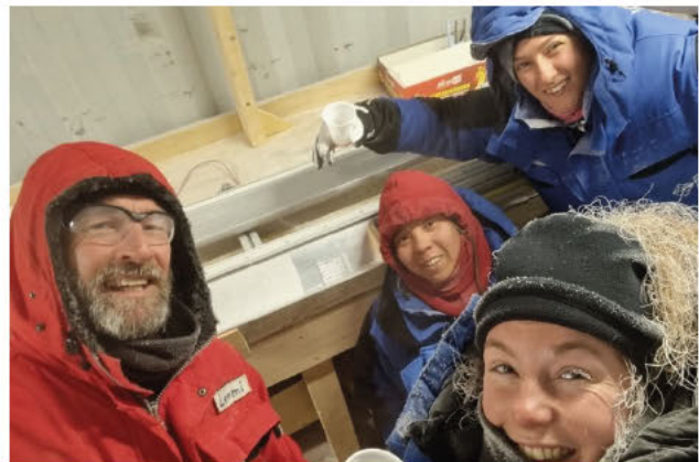
Lemmi overworked the cover of the science trench and paid a visit in the science trench.