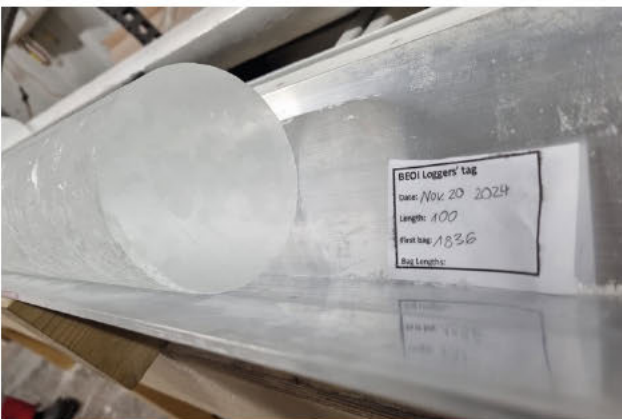
In the science trench processing of cores from this season has started.