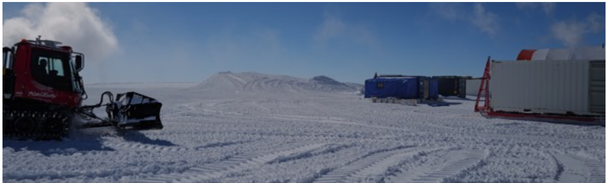
Little hill at Little Dome C camp.

The camp opening is far advanced. The snow has been cleared in between the structures and piled up on a little hill for later distribution in the area. The electrical installation in the drill trench is up and running and a major fraction of the material is already unpacked. Resultingly, we are about 1 week ahead compared to the pre-season planned schedule.