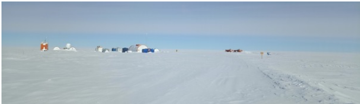
First approach during the 2024/25 season to Little Dome C camp.

Danilo Collino departed from Italy on 24 th October 2024 and proceeded from Christchurch (NZ) to Mario Zucchelli (MZS) station on 29 th October 2024. Federico Scoto and Michele Scalet departed from Italy towards Christchurch (NZ) on 3 rd November 2024 and proceeded towards MZS on 6 th November 2024. They joined as the advance party and proceeded to Concordia Station (DMC) on 7 th November 2024. After acclimatization, they visited the Little Dome C (LDC) camp on 10 th November 2024, found everything in good condition, and started cleaning out the snow. On 13 th November 2024, the advance party moved the generators and occupied the camp permanently.