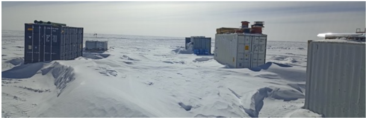
Snow in between the structures of the Little Dome C camp.

The camp opening is far advanced. The snow has been cleared in between the structures and piled up on a little hill for later distribution in the area. The electrical installation in the drill trench is up and running and a major fraction of the material is already unpacked. Resultingly, we are about 1 week ahead compared to the pre-season planned schedule.