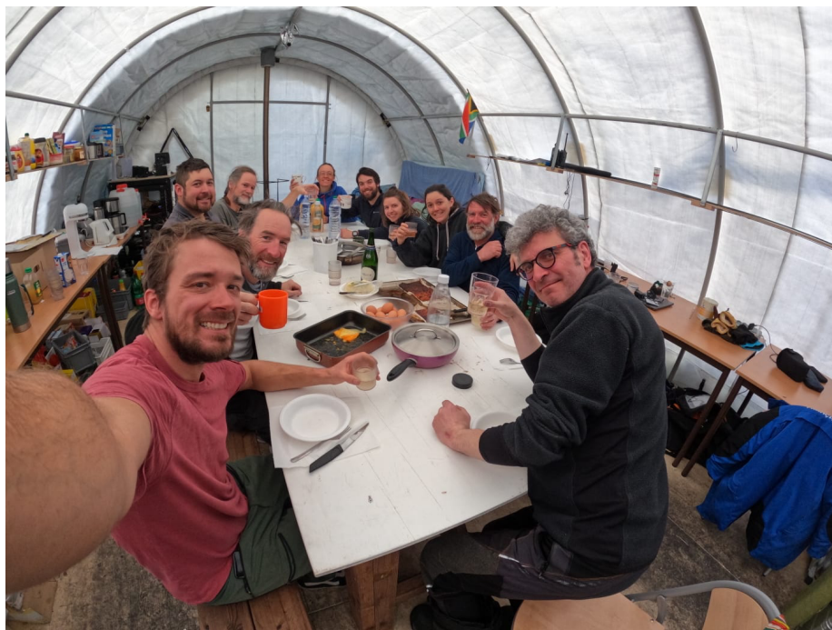
Figure 2: last lunch at Little Dome C for this season