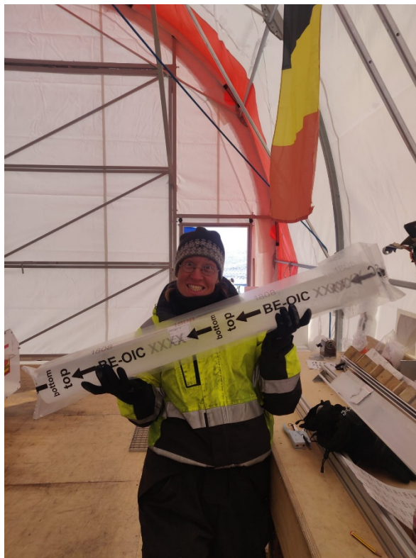
Figure 2 The 1000th meter of ice drilled this season.