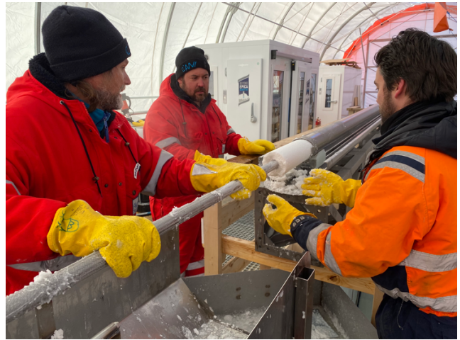
Figure 2: Chips nicely compacted in the chips chamber