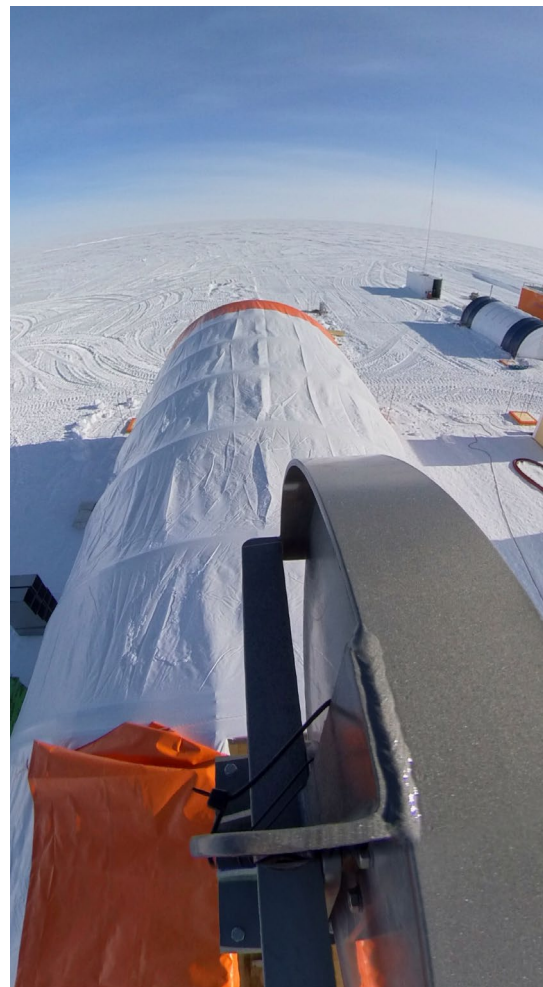
View from the roof of the BEOIC tent looking north (left) and south (right).